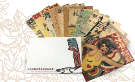
Taiwan Art and Design of the Japanese Ruled Period 12pcs · 10 × 15 cm / pcs