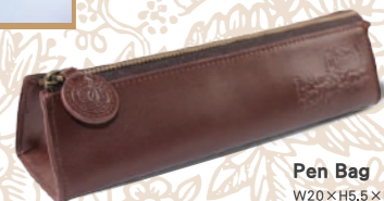
Pen Bag W20 × H5.5 × D5.4 cm