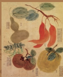
Taiwan Panorama Prints Fruits and Vegetables