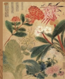
Taiwan Panorama Prints Flowers

The cultural commodities derived from the collections have three characteristics; agreeable price, practical use and special cultural value. In addition, commodity types are being developed from more delicate collections under a cooperation agreement in order to match demand for different qualities. Presently, the commodities that NTL have developed can be divided into three series according to the collections themes; Taiwan Panorama Series, Art and Design Series and Drifting Taiwan Series.