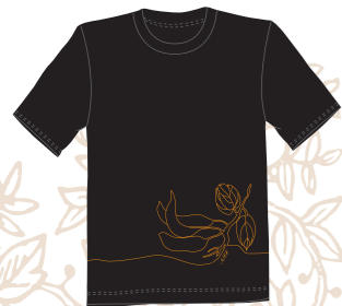
T-shirt S · M · L · XL

The Taiwan Panorama Prints is a precious book belonging to the collection of the National Taiwan Library. The original drawings were requested by Taiwan Governor Liu Shi Qi who hired painters to draw the life and product of Taiwan tribal aboriginals during Qing Qianlong Period. The original intention of these drawings was to provide the Qing Dynasty with a view of the real life of Taiwan aboriginal tribes. Now they provide evidence for research into tribal life and products. They are not only valuable but also a realistic pictorial history book.