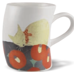
Mug/Cat 430ml Ø8 × H11 cm