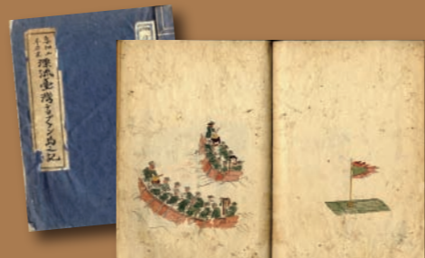
A Drifting journey to Chopulan Islet of Formosa in 1803