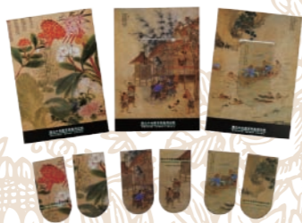
Bookmark/ Crossing the River Husking Rice Flowers 8 × 11.3 cm