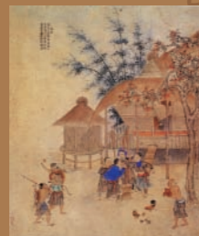
Taiwan Panorama Prints Husking Rice

This literature and information has been digitalized both for the benefit of the public and academic researchers to enjoy using the internet system and in order to enable the library to develop wider applications to expand and diversify services and information in order to face the challenge of a new digitalized era. Hence, in addition to promoting the use of it's database, NTL draws attention to it's special collections. This treasured Taiwan information can be transferred from many aspects including the value-added design of collection. This attracts the interests of the public to Taiwan's historical information through expanding the depth and breadth of Taiwan studies research.