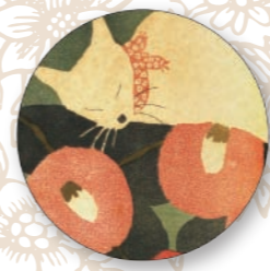
Absorbent Coaster/Cat Ø17 cm

The 'Art and Design Series' are selected from these treasured Collections, which recorded the value-added application of art and design patterns developed in Japanese ruled period at the library of the Taiwan Governor-General's Office, the forerunner of NTL. Those visionary images were merged with Chinese tradition, western and Japanese art characteristics and recorded Taiwan within such fields as industry, scenery, culture, and folklore that left precious witness for Taiwan's social cultures of that time.