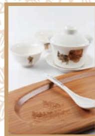
Tea Service W32 × H18 × D16 cm

This series designed in cooperation with an Art College and the Institute of Universities, applies the patterns in books onto a tea set and a leather stationery set. The simple and elegant tea set combination uses bone china teacups, pot and a matching bamboo-made tea tray that is engraved with the image of a drifting boat in a sea of books. The leather stationery set uses genuine leather partially treated with embossed branding.