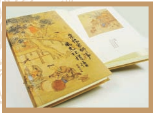
Notebook W13 × H22 × D2 cm