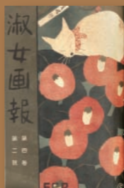
Ladies' Illustrated Magazine

The cultural commodities derived from the collections have three characteristics; agreeable price, practical use and special cultural value. In addition, commodity types are being developed from more delicate collections under a cooperation agreement in order to match demand for different qualities. Presently, the commodities that NTL have developed can be divided into three series according to the collections themes; Taiwan Panorama Series, Art and Design Series and Drifting Taiwan Series.