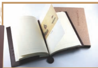
Notebook W16 × H21 × D1.7 cm