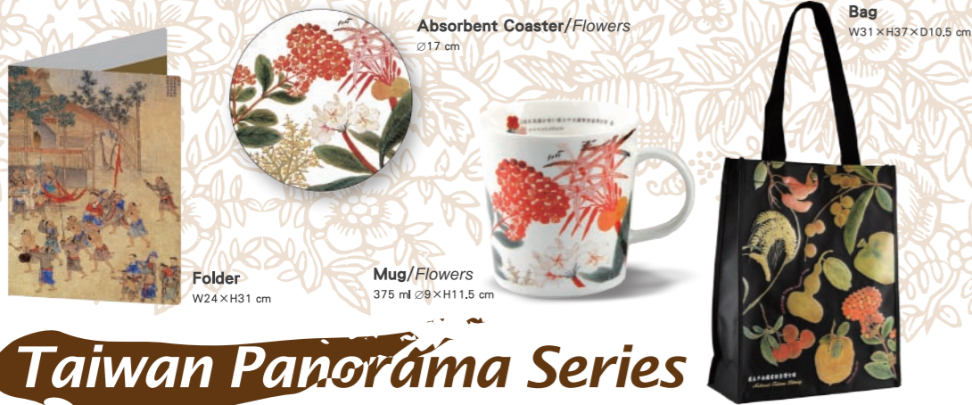
Absorbent Coaster/Flowers Ø17 cm